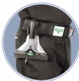
Practical Holster for the Belt