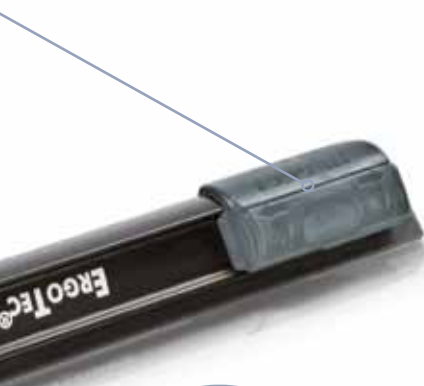
TriLoc channel locking mechanism

Frame protection: Designed to protect window frames from scratching. SmartClips can be easily replaced by hand or using a screwdriver.