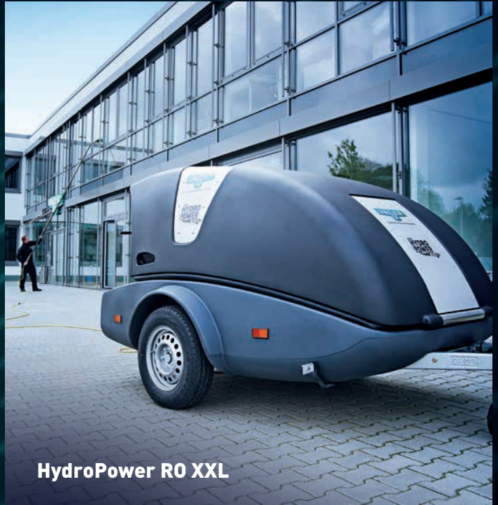
HydroPower R0 XXL